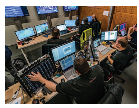
The Riedel Communications Control Room connected over 800 intercom users