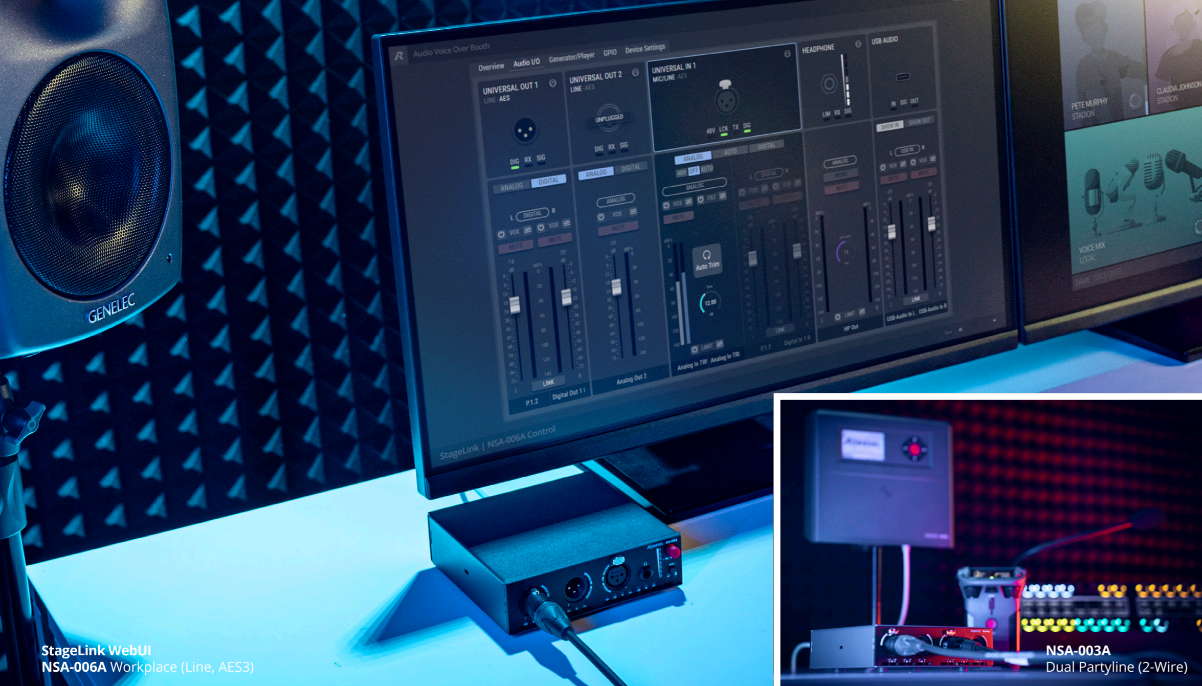
StageLink WebUI NSA-006A Workplace (Line, AES3)