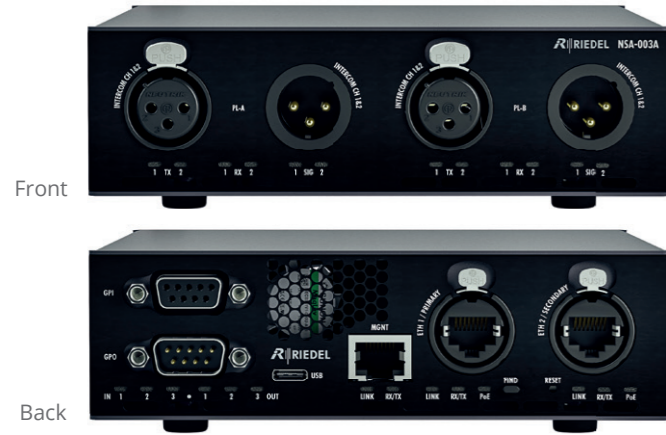
NSA-003A Dual Partyline (2-Wire)

Audio interface box that enables seamless integration of third-party legacy 2-wire partylines into Artist and Bolero systems via SMPTE 2110.