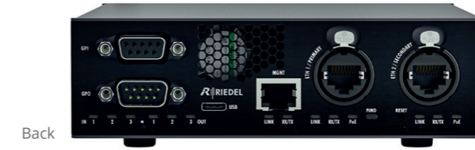
NSA-007A Dual In/Out (4-Wire)

SMPTE 2110 audio interface that features 2 inputs and 2 outputs in broadcast quality, can also function as a dual analog or digital 4-wire device for Artist and Bolero intercom systems.