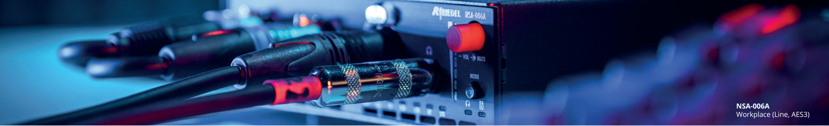
NSA-006A Workplace (Line, AES3)