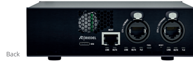
NSA-004A Quad In (Line, AES3)

Small form factor device with 4x analog (Mic/Line) & digital (AES3) inputs for applications where small portions of inputs with flexible connection variations must be distributed over a wider area.