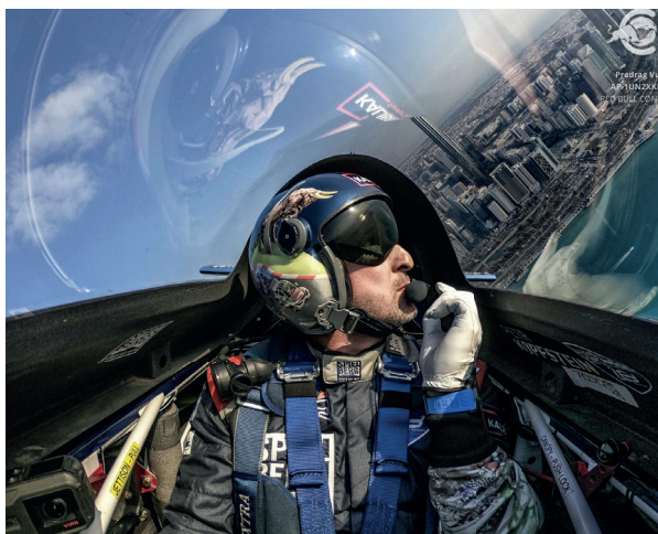
Stunning pictures at 12G through reliable wireless video links and HD cameras

From crew communications and wireless video for professional motorsports (F1 and DTM), air races (Red Bull) and even mission-critical projects like the Stratos jump, our resume now includes services for referee communications. For this challenging new requirement, Managed Sports Services has developed customized hardware and software in combination with providing dedicated Riedel engineers, both on-site and remotely, to ensure the smooth implementation of our services.