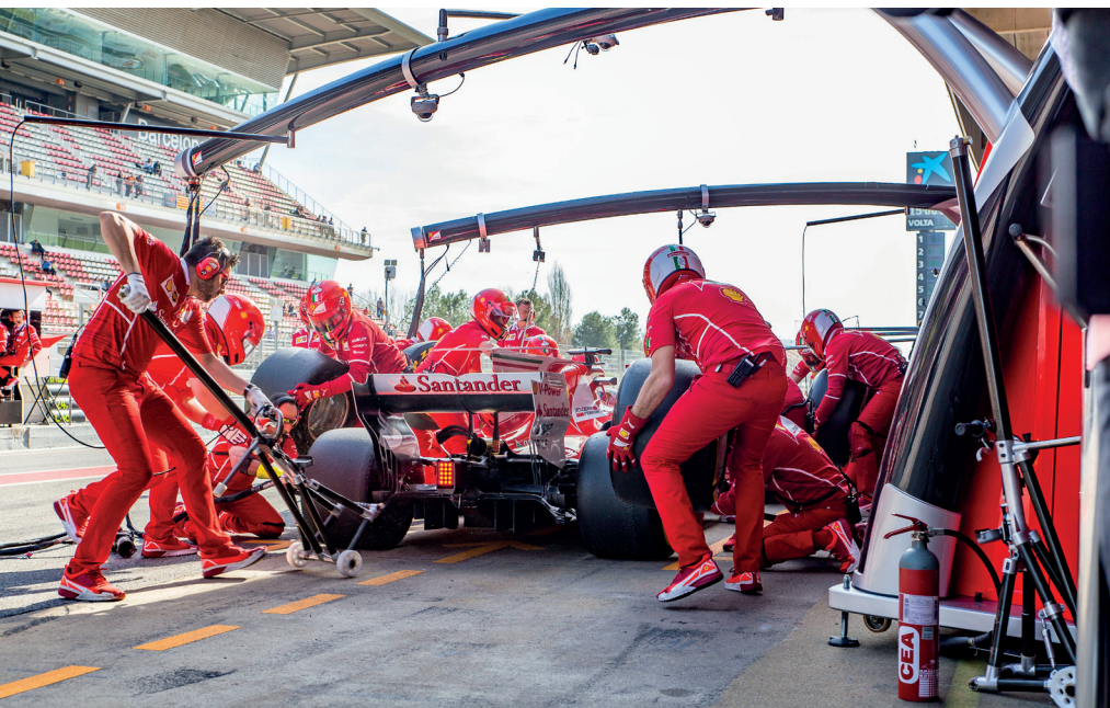
Clear communications at 350km/h

Often the size, weight, or functionality of an existing product or technology is not sufficient for the challenging environments where they must perform. For this reason our Managed Sports Services division develops tailor-made products that are suitable for very specific applications.