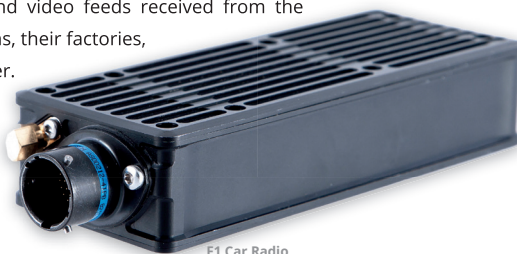
F1 Car Radio

Riedel's custom-engineering creates seamless, real-time communications between race control, teams, and drivers, making Formula 1 even more exciting for motorsport fans around the world. Involved in this racing series since 1993, Riedel manages all audio and video feeds received from the racetrack and distributes them to all racing teams, their factories, the F1 governing body, and the host broadcaster. A dedicated team of 20 engineers sets up the systems onsite and supports all teams and authorities each race weekend throughout the entire season.