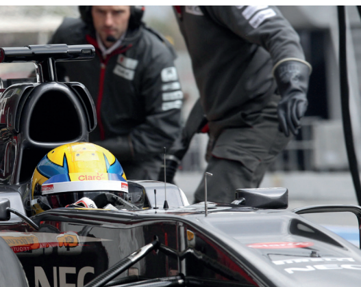
Custom-engineered solutions include antennas and in-car radios