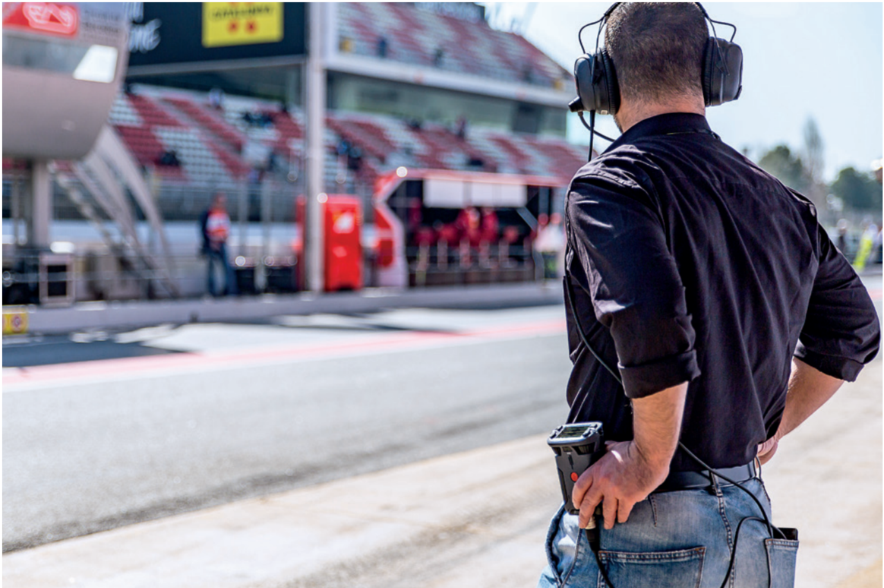
The MAX headset has been designed for the special communication needs in motor sports such as Formula 1. In this environment the crew at the pitwalls need to communicate under high ambient sound pressure levels. This is why our MAX Headset is perfectly suited for the use case.