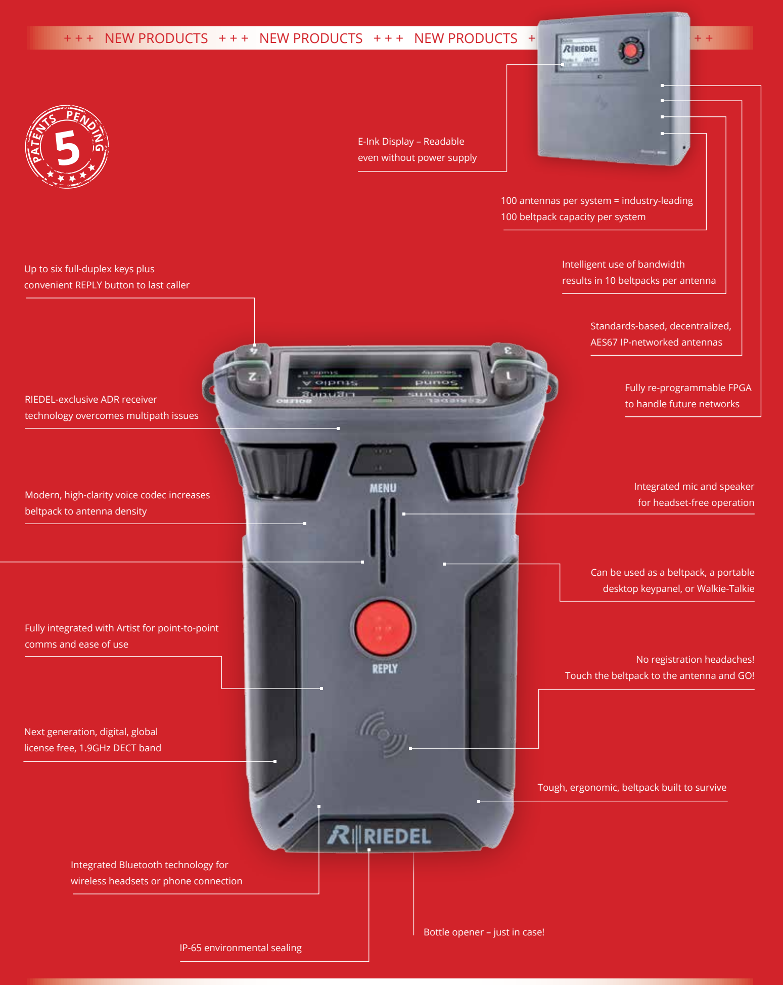
+++ NEW PRODUCTS +++ NEW PRODUCTS +++ NEW PRODUCTS +++ NEW PRODUCTS +++