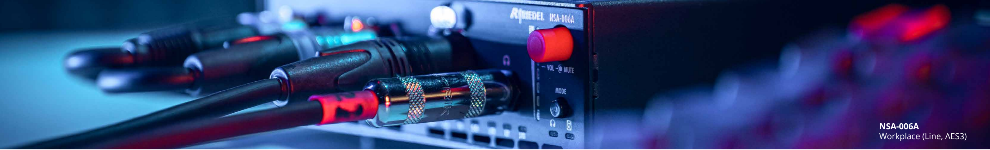
NSA-006A Workplace (Line, AES3)