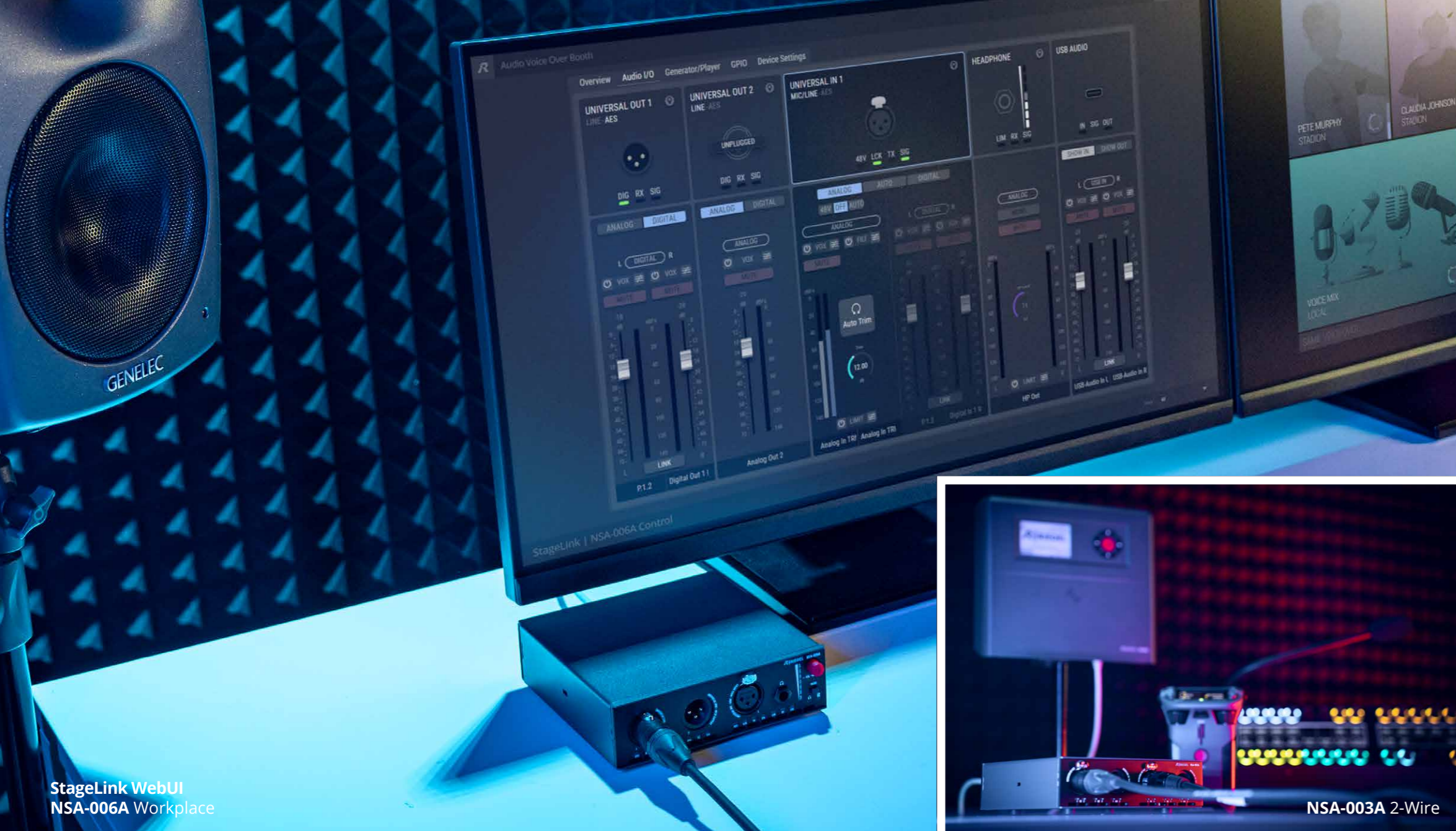
StageLink WebUI NSA-006A Workplace