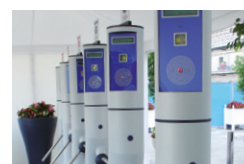
Access Control & Accreditation Solutions