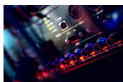
Media Network Solutions