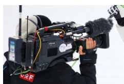
RF Camera Solutions