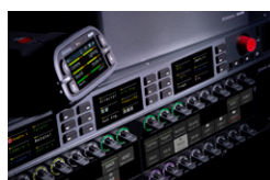
Intercom & Professional Radio Solutions