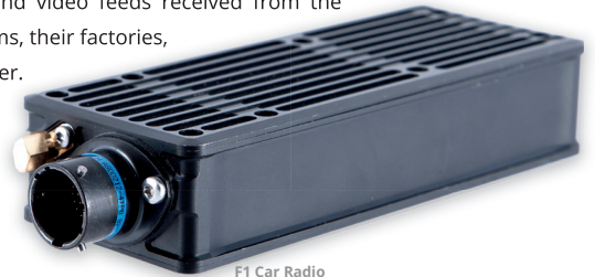
F1 Car Radio

Riedel's custom-engineering creates seamless, real-time communications between race control, teams, and drivers, making Formula 1 even more exciting for motorsport fans around the world. Involved in this racing series since 1993, Riedel manages all audio and video feeds received from the racetrack and distributes them to all racing teams, their factories, the F1 governing body, and the host broadcaster. A dedicated team of 20 engineers sets up the systems onsite and supports all teams and authorities each race weekend throughout the entire season.