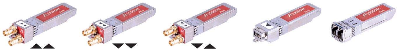
-A: HD/3G (ST2022-6 & ST2110) Encapsulator -B: HD/3G/12G (ST2110) Encapsulator

By a simple change of the software license, the device can become JPEG-2000 encode or decode, an audio router, or even a 16x1 multiviewer.